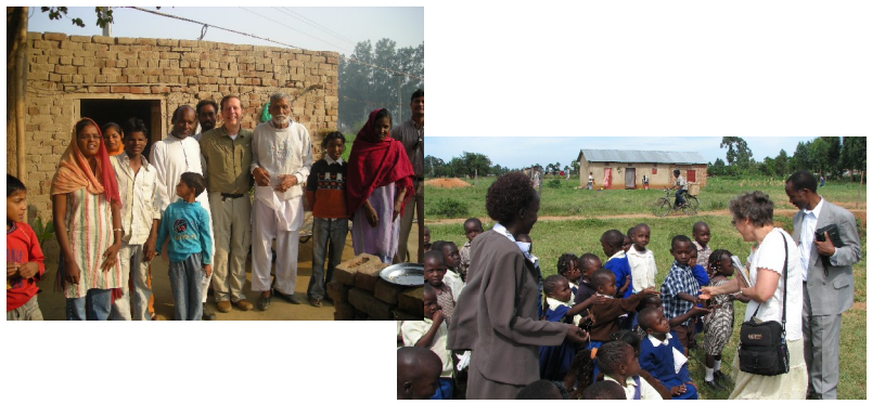
Teaching God's People To Hear The Voice Of The Lord